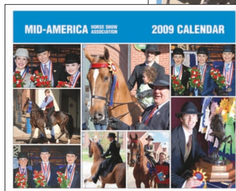
Full Color Wall Calendar with Show Dates