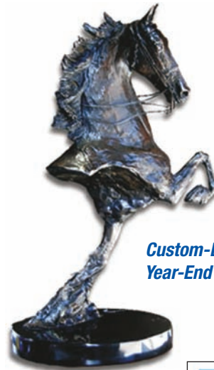
Custom-Designed Year-End Trophies